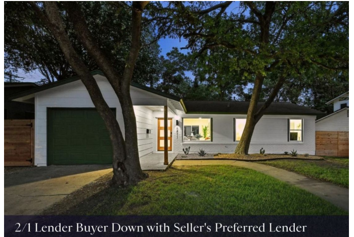
2/1 Lender Buyer Down with Seller's Preferred Lender

Tucked at the crossroads of Allandale and Crestview—two of Austin's most beloved neighborhoods—this fully reimaged 3-bedroom, 2-bathroom stunner has been taken down to the studs and thoughtfully rebuilt with style, substance, & soul. Every inch of this home reflects modern elegance & functional design, offering a turnkey lifestyle in a location that's hard to beat. Just minutes from The Domain, Q2 Stadium, and a vibrant array of Austin's top-rated restaurants, breweries, and boutiques, this gem delivers the perfect fusion of charm, convenience, and community. Inside, the living room features a pitched ceiling with a large picture window that fills the space with natural light, complemented by recessed lighting & luxury vinyl plank flooring. The open-concept layout connects the spacious dining area to a modern kitchen equipped with waterfall quartz countertops, white cabinetry, a black undermount sink, & stainless steel appliances. All three bedrooms offer recessed lighting, ceiling fans, & generous closets. Both bathrooms offer a seamless design with quartz countertops & a neutral finish. A full laundry room and drop zone off the garage add everyday functionality. Out back, the fully fenced yard with a new horizontal wood fence is a blank canvas—ready for turf, sod, or low-maintenance landscaping. Whether you're catching an Austin FC match, browsing local markets, or enjoying craft cocktails with friends, this location delivers the very best of